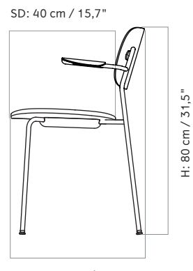
D: 50,5 cm / 19,9"