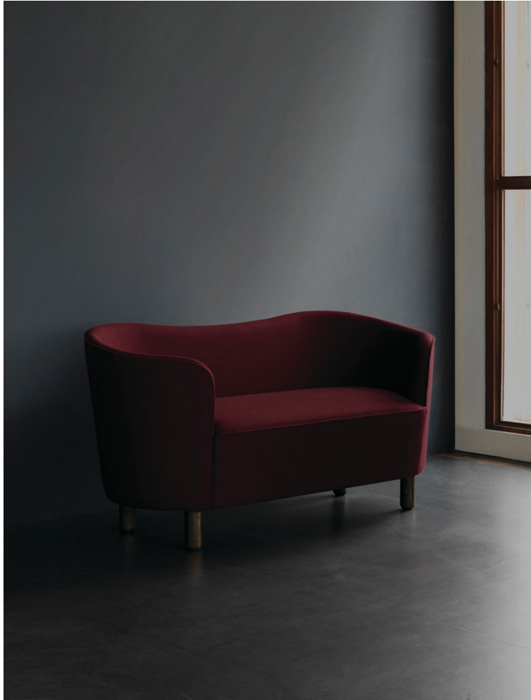
MINGLE, SOFA Designed by Flemming Lassen