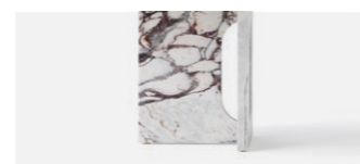
CALACATTA VIOLA MARBLE