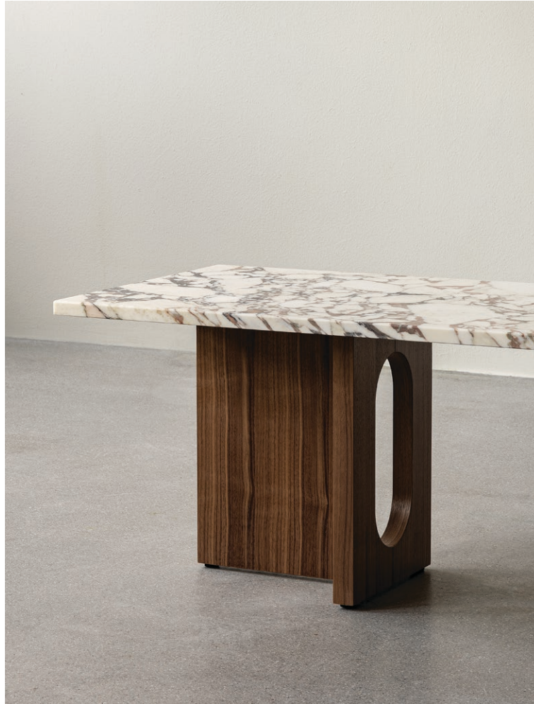
ANDROGYNE LOUNGE TABLE Designed by Danielle Siggerud