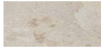
KUNIS BRECCIA STONE