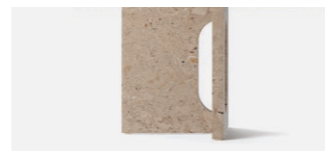
KUNIS BRECCIA STONE