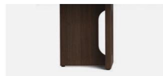
DARK STAINED OAK