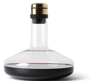
Clear / Brass 4683829