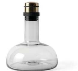
Smoke / Brass 4680949