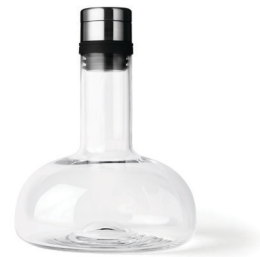
Clear / Steel 4680069