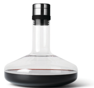
Clear / Steel 4683039