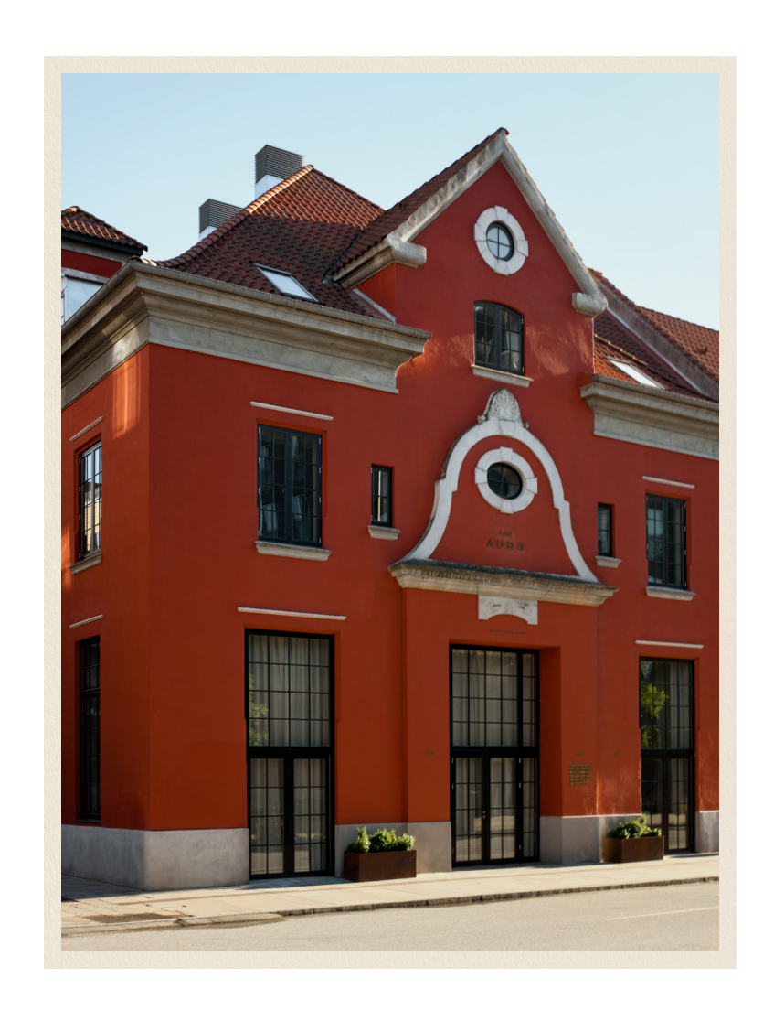
CITY GUIDE Experience Copenhagen trough the eyes of Audo