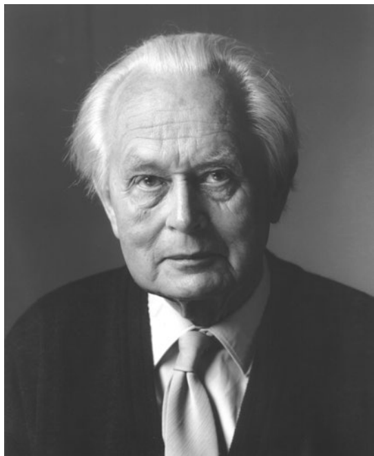
Piet Hein 1905-1996

A CREATIVE GENIUS ONE OF DENMARK'S GREATEST NATIONAL TREASURES