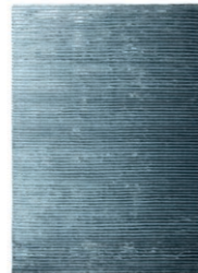
MIDNIGHT BLUE 5855779