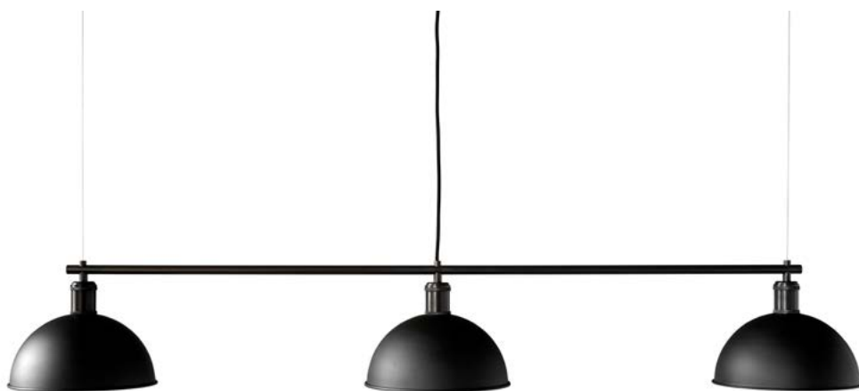
Black / Bronzed Brass 1937859