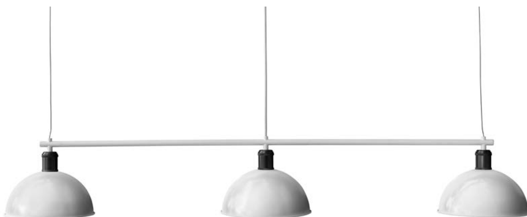
Ivory / Bronzed Brass 1937649