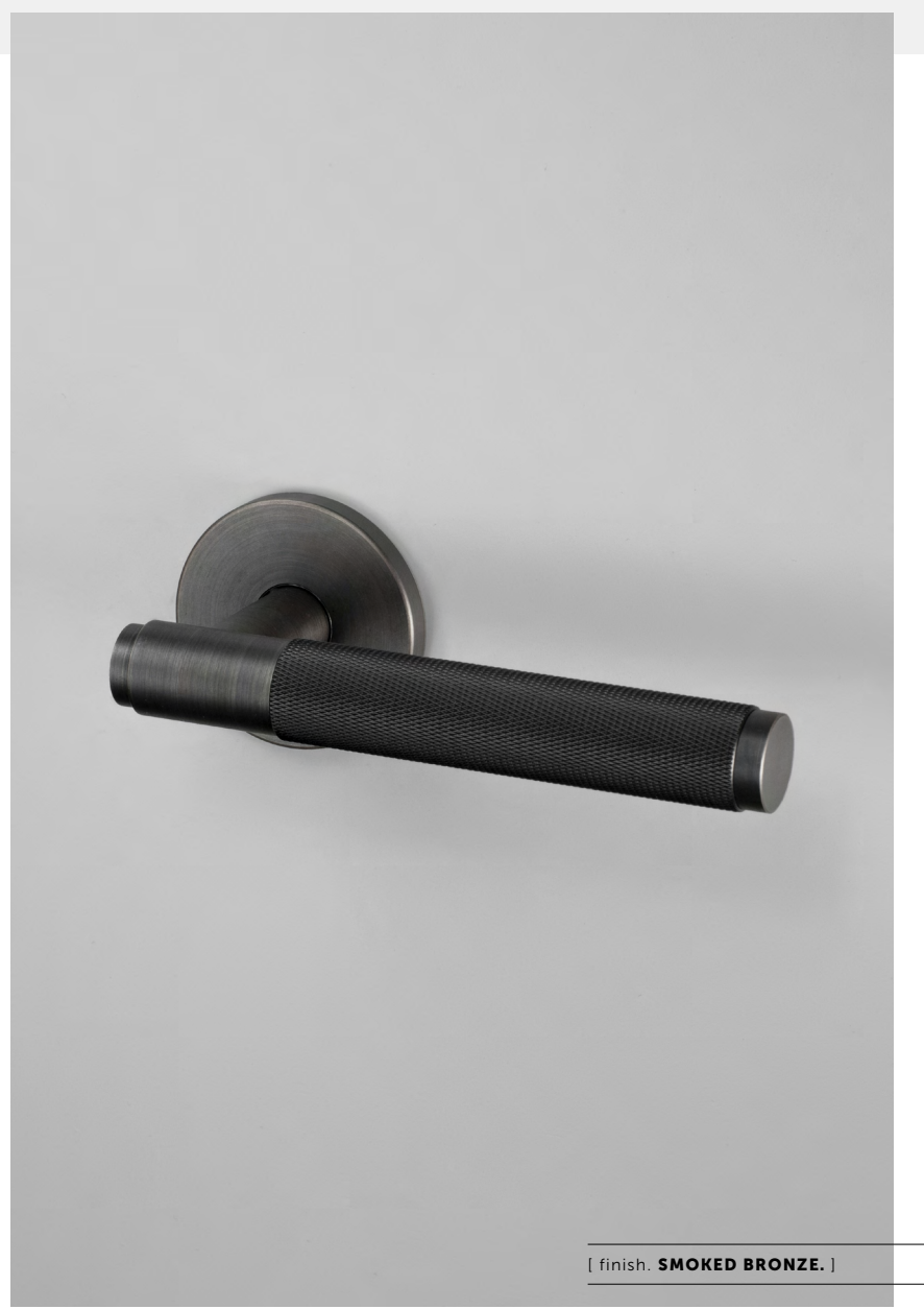
*All images are of the 4 mm thick Unsprung Door Handle Rose.