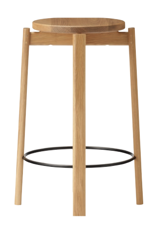
NATURAL OAK WITH BLACK RING 9120039

Counter stool in solid, lacquered walnut or FSC<sup>™</sup>-certified solid, lacquered oak. Available with black, brushed steel or brass foot ring. Flat packed for easy self-assembly.