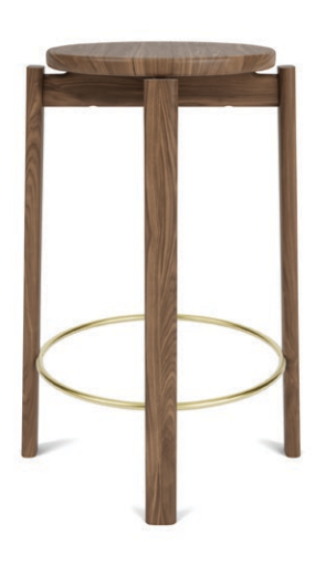
WALNUT WITH BRASS RING 9120879