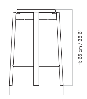
0: 46 cm / 18,1"