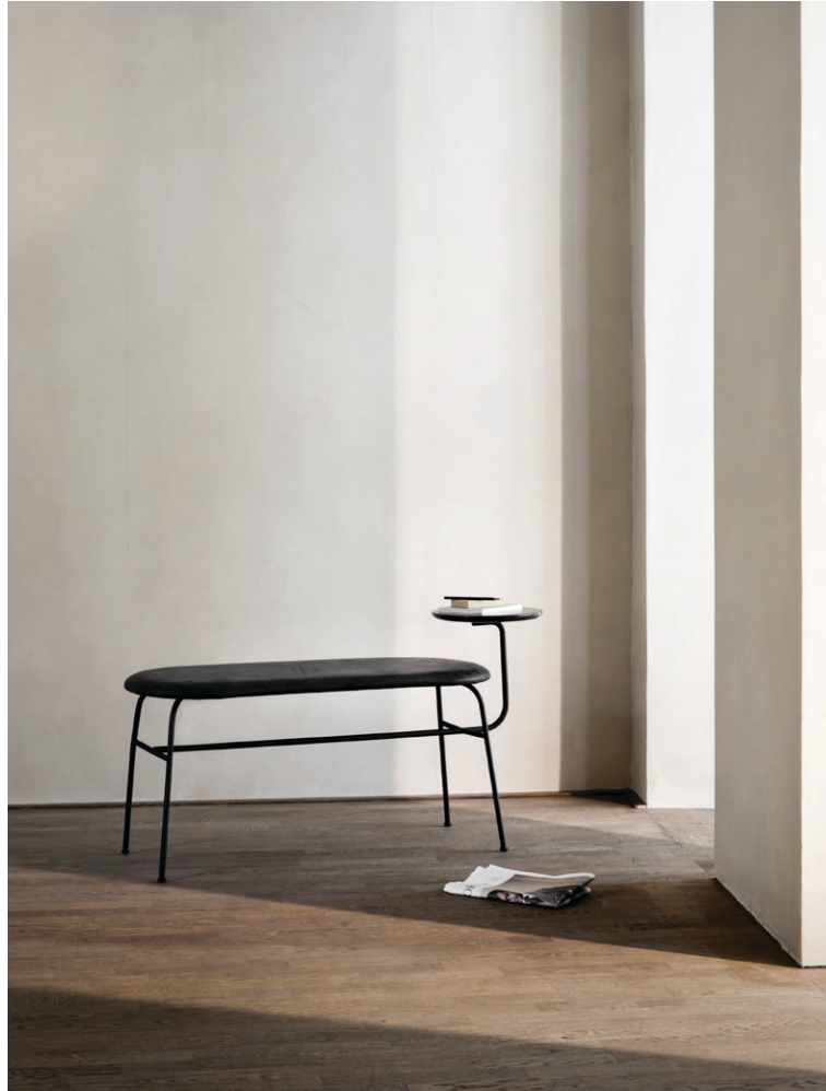
AFTERROOM BENCH Designed by Afteroom