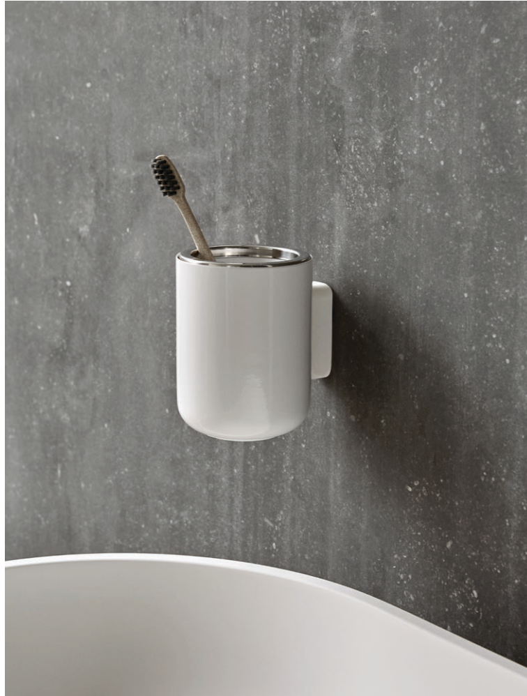
TOOTHBRUSH HOLDER Designed by Norm Architects