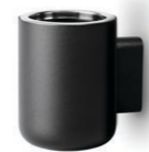
BLACK, WALL 7710509