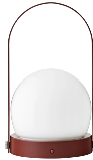
Burned Red 4864349