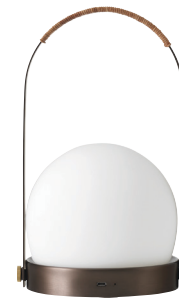
Bronzed Brass 4863859