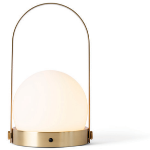
Brushed Brass 4863839