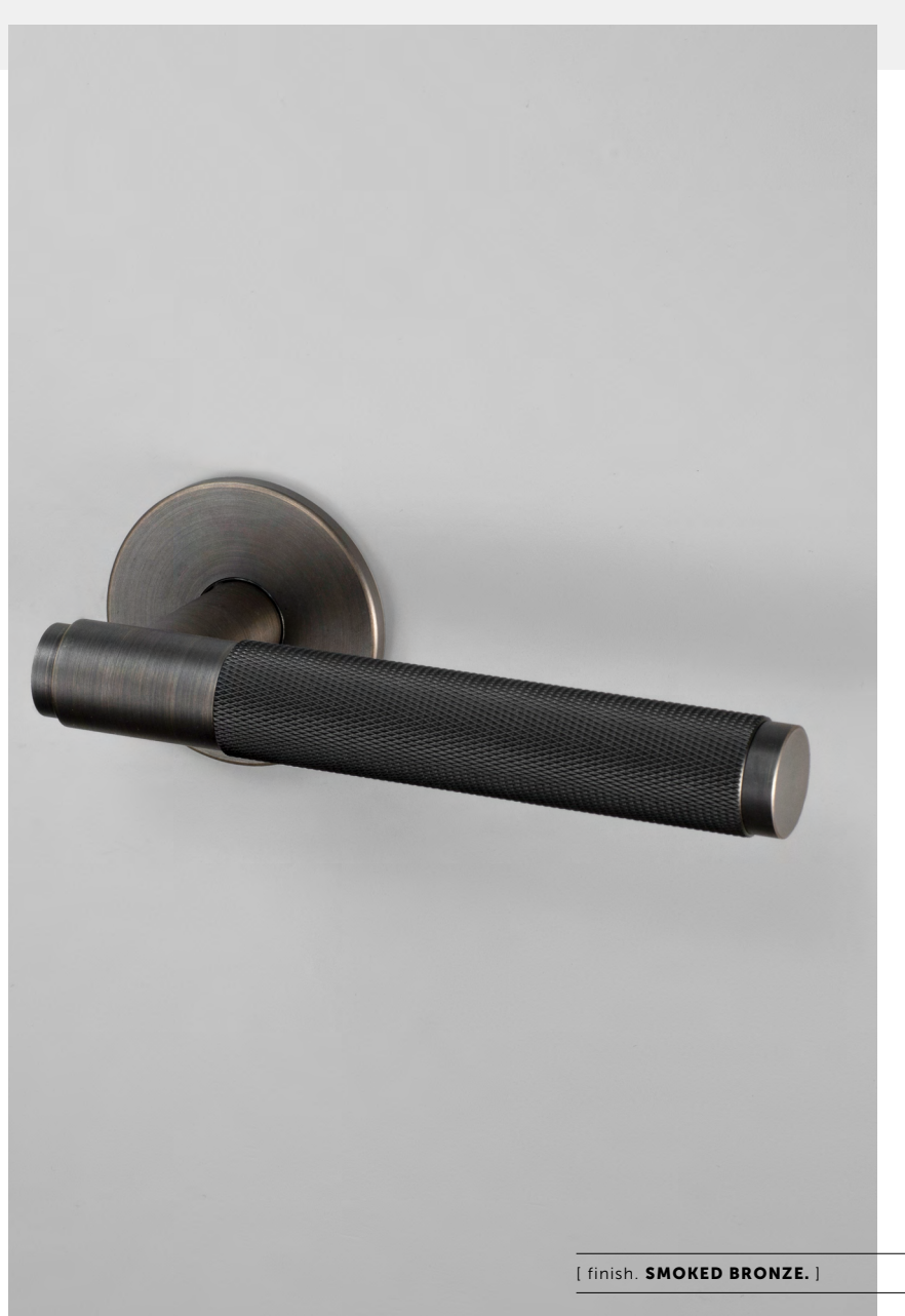
*All images are of unsprung door handle rose.