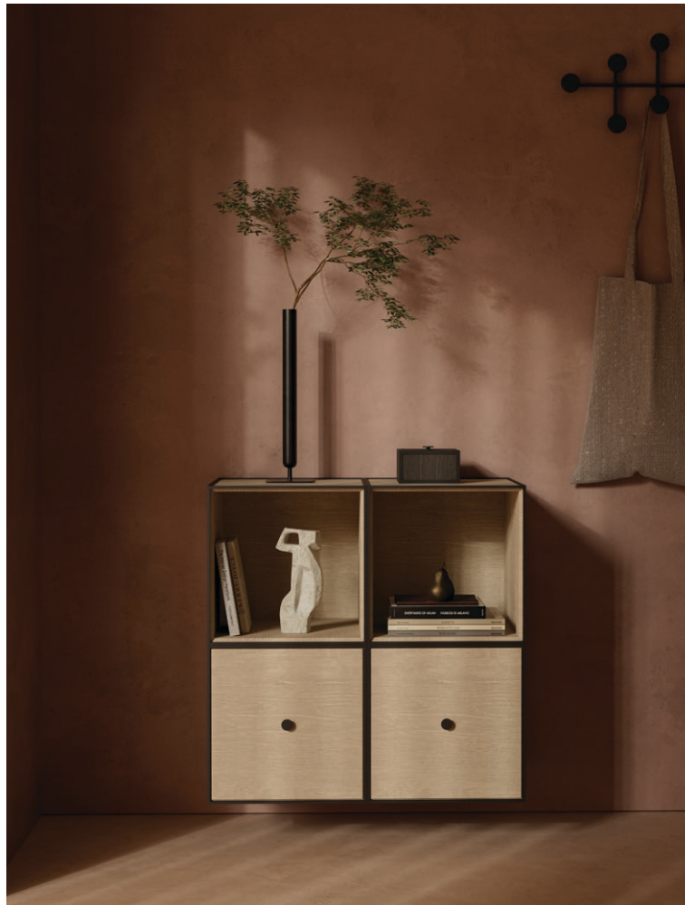
FRAME FOUR STANDARD Designed by Audø