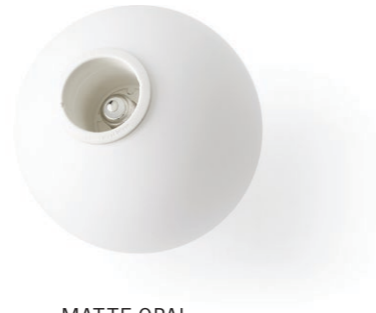
MATTE OPAL 1470639

Portable, opal glass LED bulb with a matte finish and dimmable as standard.