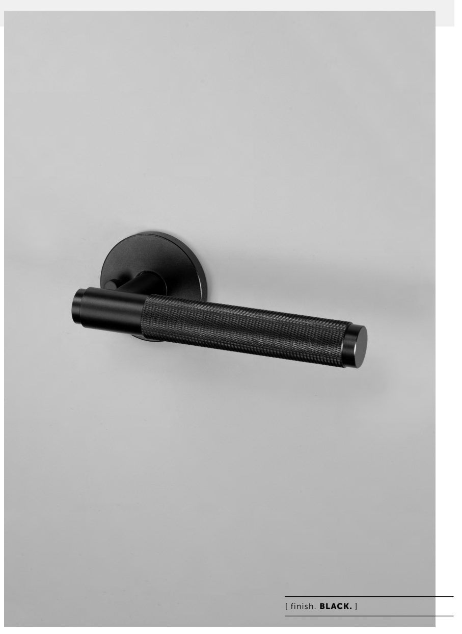
*All images are of the 8 mm thick sprung Door Handle Rose.