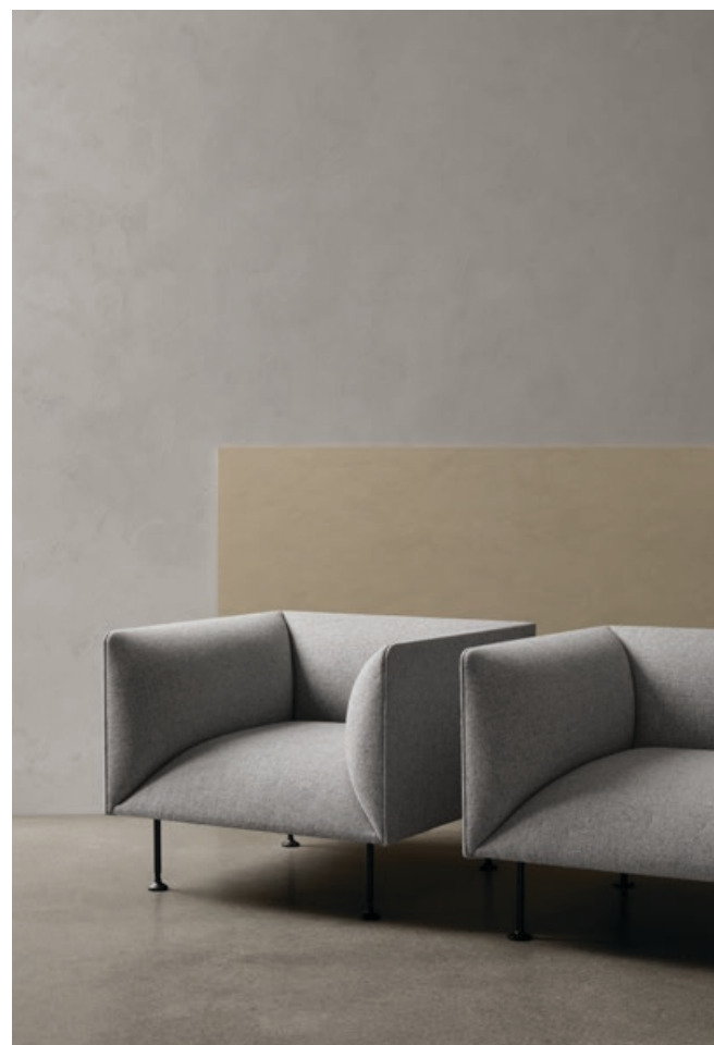
Godot Sofa, 1-seater, Hallingdal 130, by Iskos-Berlin

Available in fabrics from our upholstery programme. Standard lead times apply. Custom upholstery available upon request. For further information please refer to MENU Upholstery Programme.