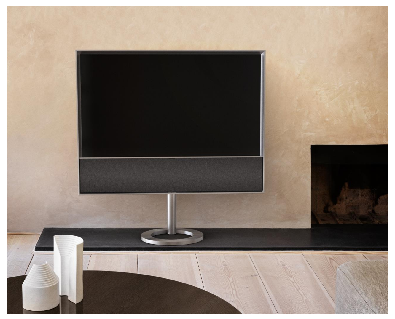
Bang & Olufsen today announced the expansion of its TV portfolio with the new 48" Beovision Contour, updates to Beovision Eclipse-55 2<sup>nd</sup> Generation and the addition of Beovision Harmony Motorized Floor Stand to its outstanding collection.

"Sound is more than half the picture" is at the heart of Bang & Olufsen's Beovision philosophy. Combining an integrated 3-channel powerful sound system with the latest generation OLED TV technology from LG Electronics, renowned for excellent visuals, Bang & Olufsen's TV portfolio guarantees a truly immersive home entertainment experience. This winning formula makes Bang & Olufsen one of its kind in the market by offering the best in performance whilst maintaining an uncompromising approach to design and craftsmanship. With the launch of Beovision Contour, Bang & Olufsen's TV portfolio now offers a range of TVs available in 48" to 88" screen sizes with three diverse concepts to suit any requirement: