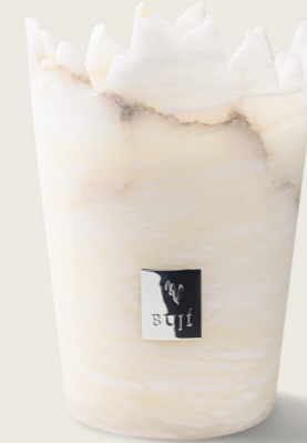
SOLEIL ROYAL Bergamot & Lemon Sicily

Picturing a citrus garden nested on a white cliff swept by the sea winds, this scent carries an earthy wood base made of cedar, juniper and eucalyptus grown on dry limestone, at variance with the luscious fragrance of freshly squeezed fruit and the delicate sweetness of orange blossom. Spiced up by the unique verve of basil giving it a majestic final touch, Soleil Royal is a cool lively whiff awakening all the senses with its rich olfactory palette while uplifting the mind with its surprising spontaneity.